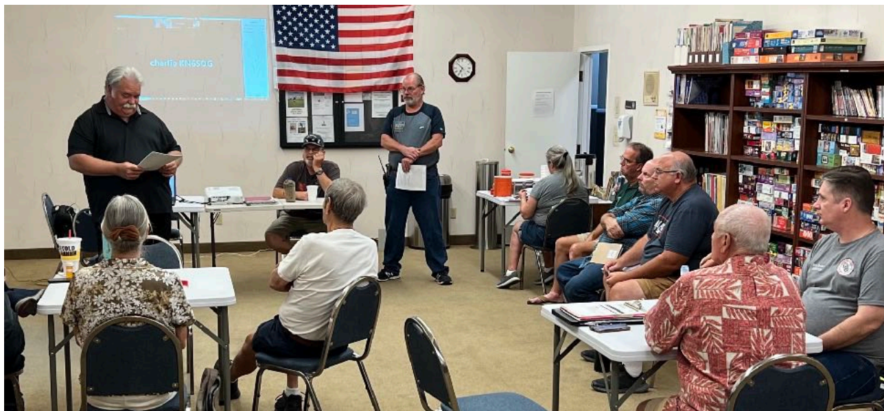
LDFARC MEETING SEPTEMBER 2022